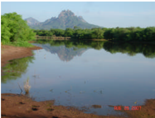
Water Holes at some of our ranches

So.... If you love to hunt BIG COUES DEER , you owe it to yourself to take a trip to beautiful Obregon Sonora, Mexico. This is where we lease ranches where they plant sorghum crops and the hunting pressure is so light that many of the bucks have never been hunted!