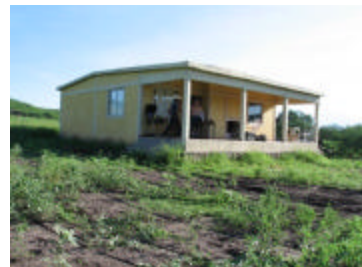
Pictured are 3 of our ranch house accommodations.

The landscape is amongst some of the finest and most beautiful in the Southern Sonora Mexican Desert.